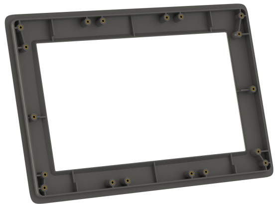
Bare 7.0" Bezel - Back