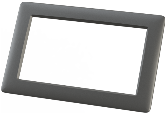
Bare 7.0" Bezel - Front