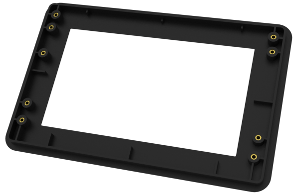
Bare 4.3" Bezel - Back