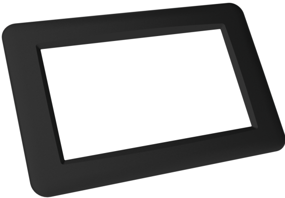
Bare 4.3" Bezel - Front